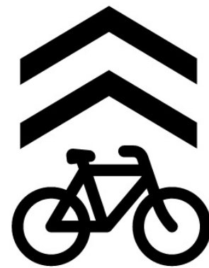
Sharrow Pavement Marking

Bicycle components including off-street multi-use paths, on-street bicycle lanes, bicyclist detection at traffic signals, and the addition of sharrows are included in many road expansion projects and are sometimes the sole purpose of a project.