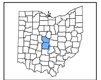
Ohio Location Map