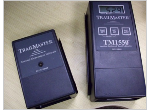
▲ Infrared Trail Counters

For more information about bicycle and pedestrian counts, please contact Joe Fish at jfish@morpc.org or (614) 233-4123.