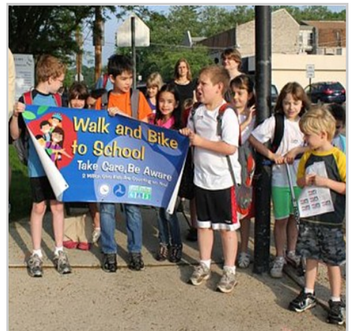
▲ Kids at Robert Louis Stevenson Elementary School in Grandview Heights, Ohio, participate in Walk to School Day

Additional resources can be found at MORPC's www.morpc.org/walktoschool .