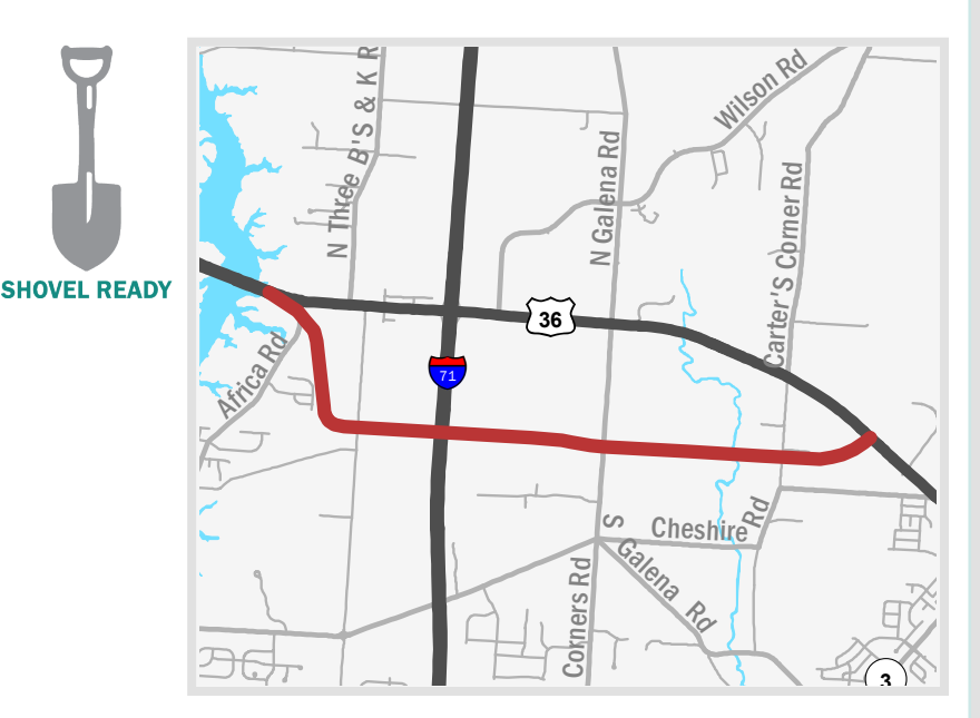
Project Location Interstate 71 and US 36/SR 37

Jobs Supported: Supports > 2,900 jobs projected by 2040