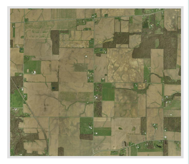
Project Location CR 36 from SR 47 to SR 235