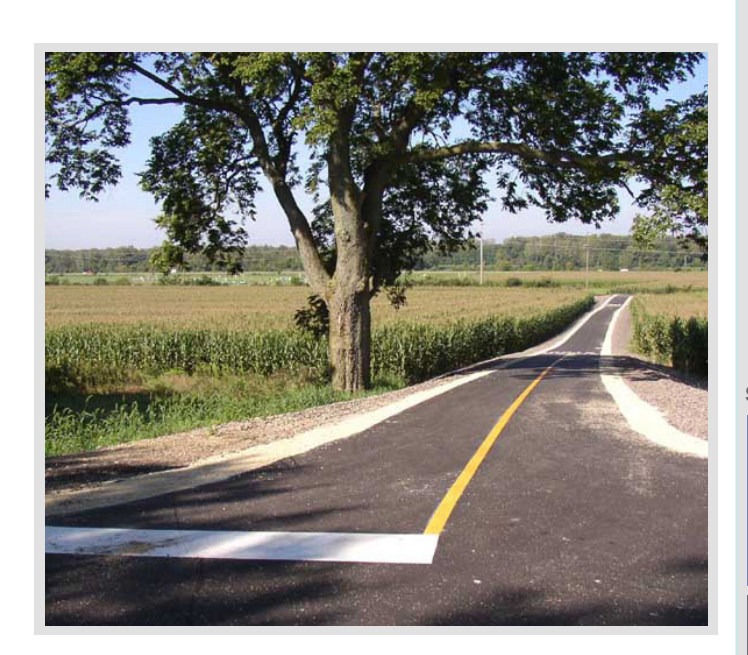
Paved portion of the Simon Kenton Trail south of Urbana