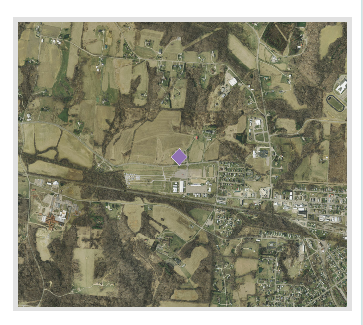
Aerial view of project location

Former Perry County Home Farm located just west of the Village of New Lexington on SR 37