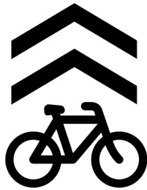
Sharrow Pavement Marking