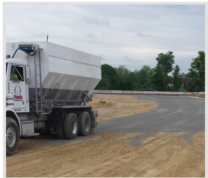
Construction of recently-completed Home Road extension west of US 23