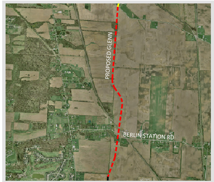
Potential alignment of Glenn Parkway