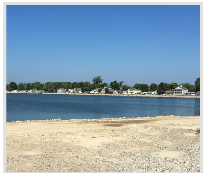
Buckeye Lake during reconstruction of the dam