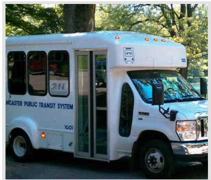
Lancaster Public Transit System vehicle

C O N G R E S S H O U S E 3 - Beatty 15 - Stivers SENATE Brown Portman