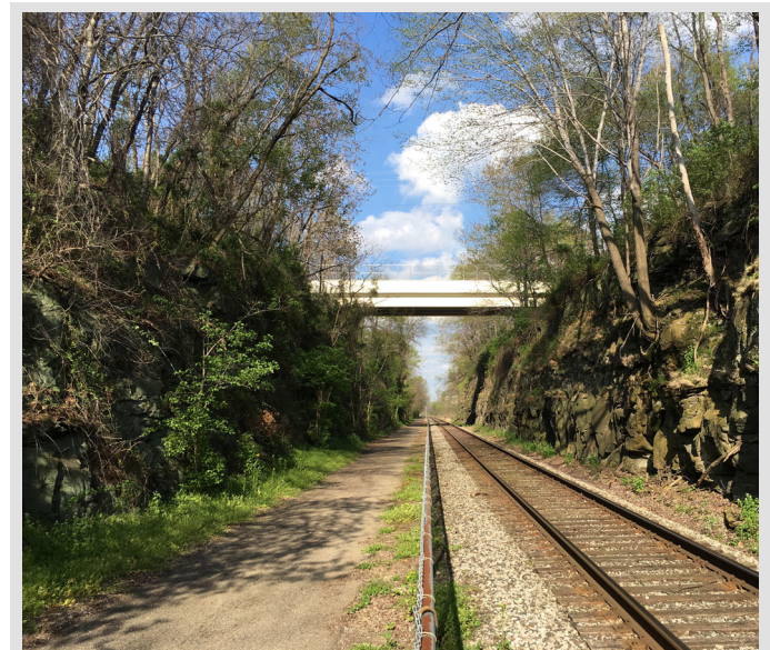
Example of scenic trail along a railway corridor in another part of Ohio