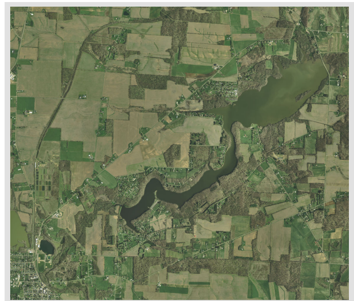
Current aerial view of Knox Lake area