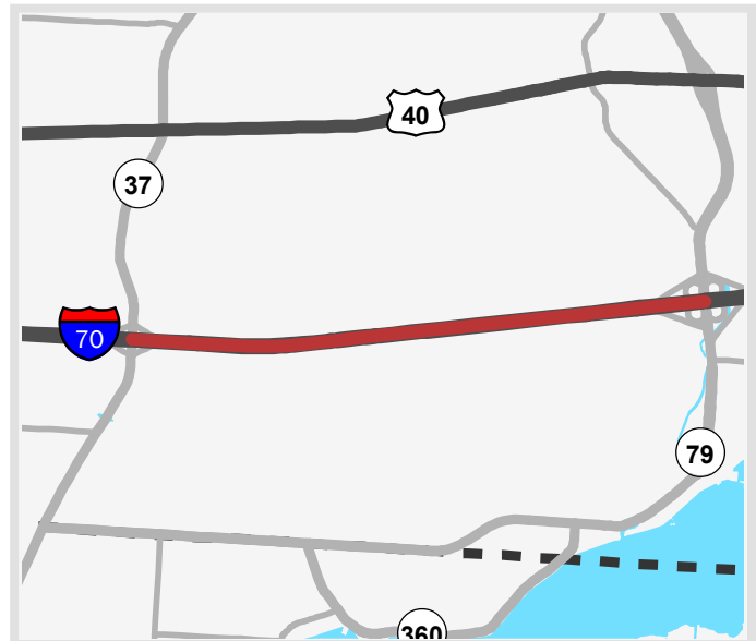
Project Location Interstate 70 between SR 37 and SR 79

Partner Agencies: Licking County Area Transportation Study (LCATS), Licking County Engineer's Office, Licking County Soil & Water District, Grow Licking County CIC, Villages of Buckeye Lake and Hebron, Union Township, Heath-Newark-Licking Port Authority