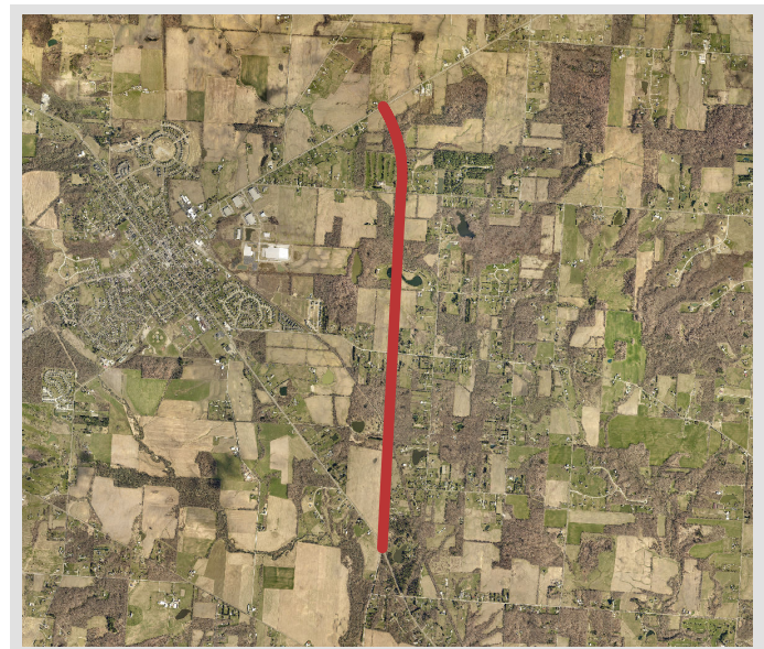
2016 aerial view of the project location