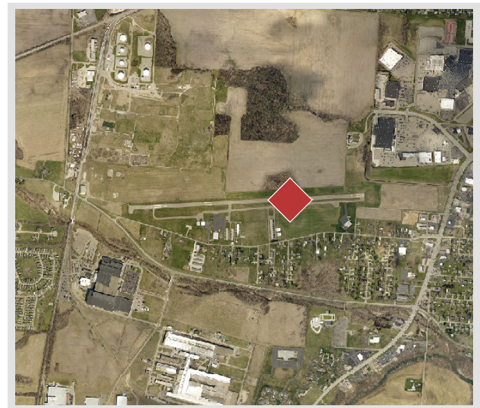
2016 aerial view of the project location