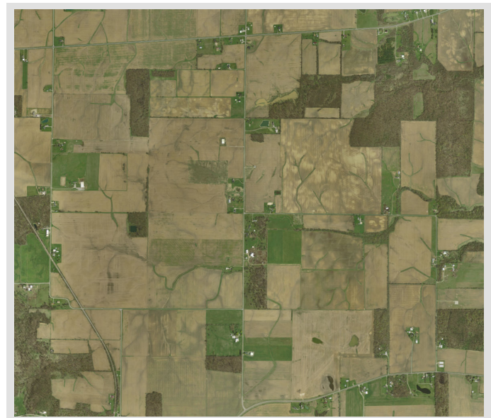
2013 aerial view of project location