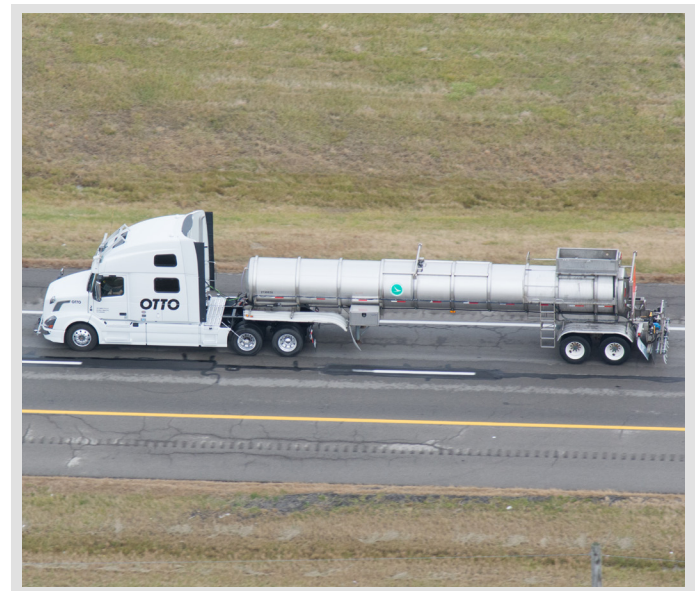
Autonomous truck demonstration test on the 33 Smart Mobility Corridor