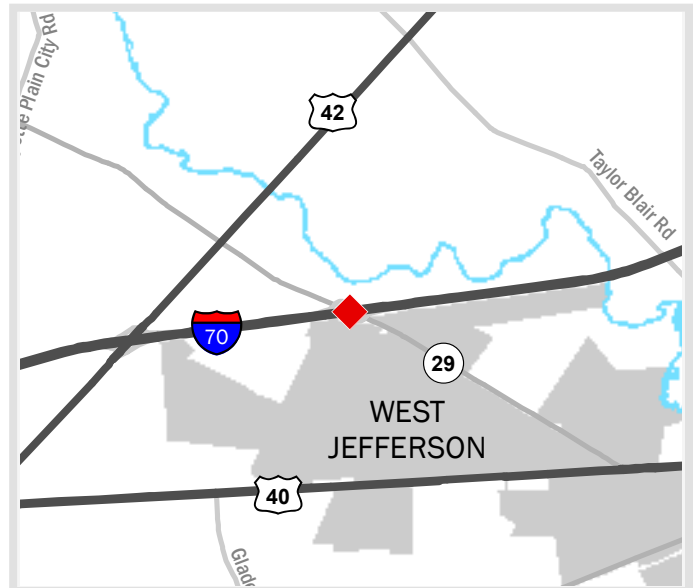
Project Location Interstate 70 at State Route 29 in West Jefferson

Jobs Supported: Supports >6,000 existing jobs and continued manufacturing, warehousing, and distribution growth