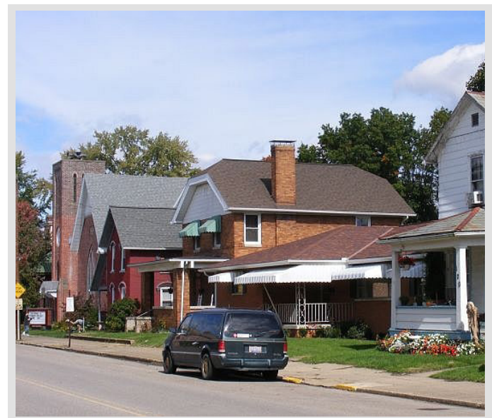
Village of Roseville