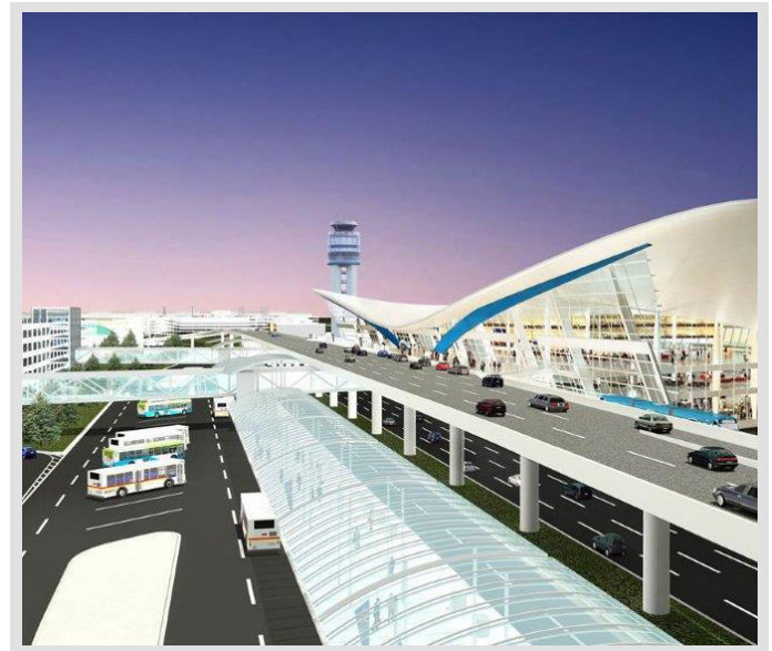
Conceptual rendering on new terminal to demonstrate functionality