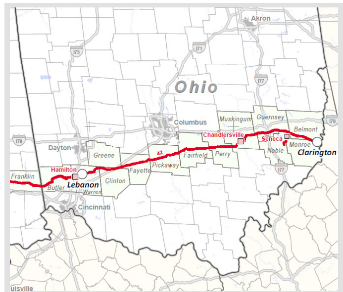
Rockies Express (REX) Pipeline corridor through Ohio

Portions of Franklin, Madison, Pickaway, and Union Counties (specific pipeline routes and service areas not yet determined)