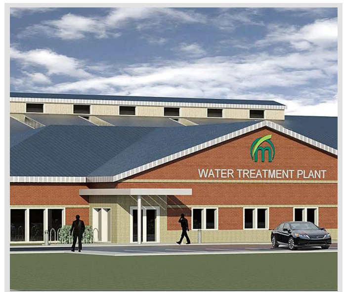
Rendering of the proposed City of Marysville Water Treatment Plant