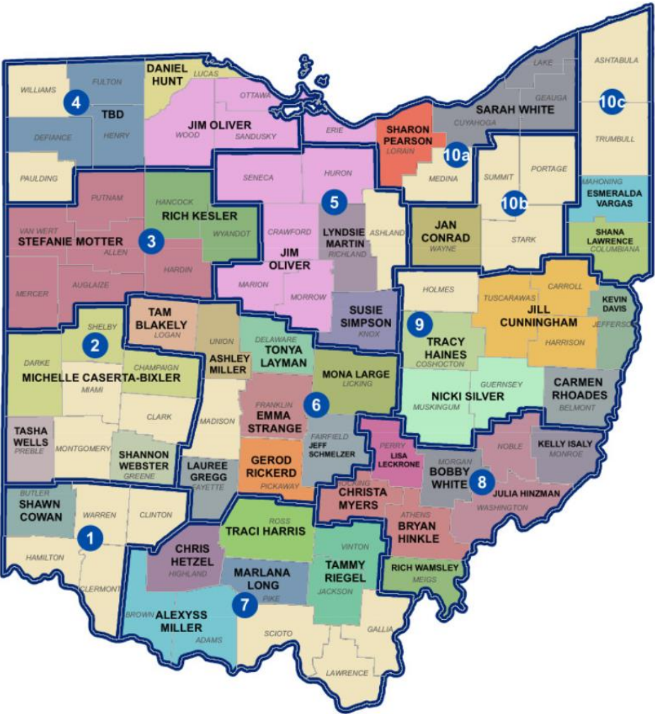
MOBILITY MANAGER COUNTY MAP