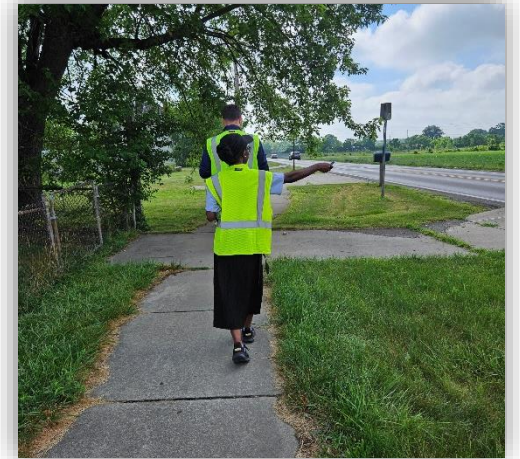
Franklin Township Walk Audit

www.morpc.org/program-service/technical-assistance-program