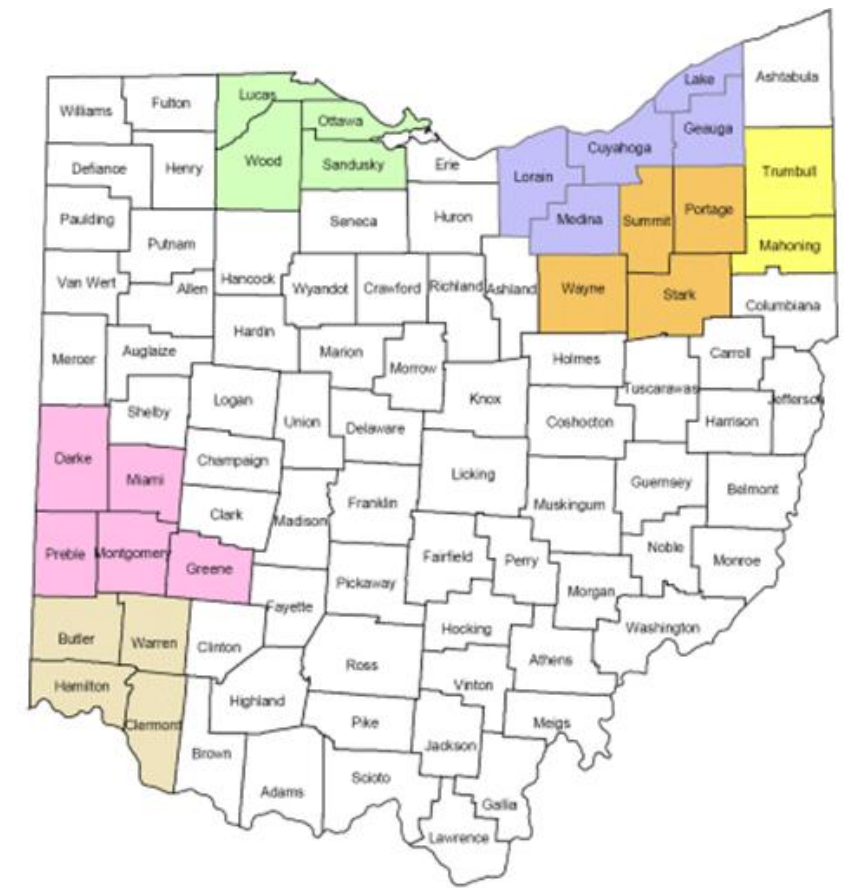
Government Agencies Responsible for 208 Plans