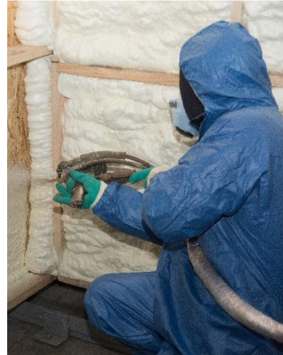
Home Energy Efficiency Program (Weatherization)

▲ MORPC helps low and moderate-income homeowners improve their homes at no cost through two programs.