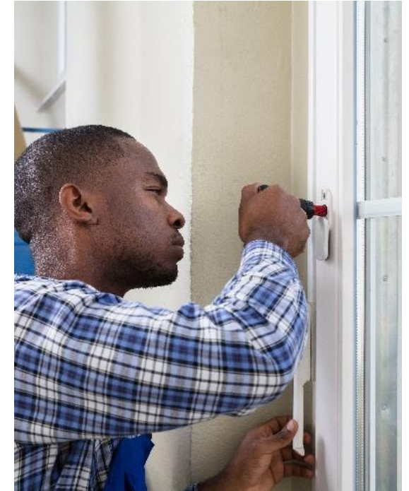
Healthy Homes + Repair Program

Each program has different eligibility requirements. If applicants are ineligible for MORPC's programs, staff will redirect them to other resources in our region.