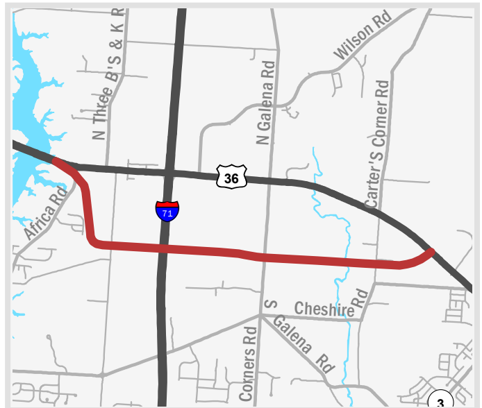
Project Location Interstate 71 and US 36/SR 37