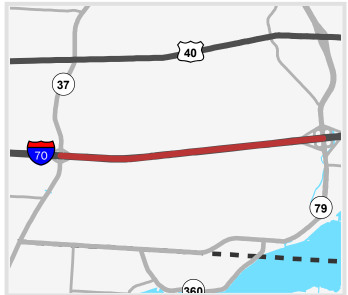
Project Location Interstate 70 between SR 37 and SR 79

Partner Agencies: Licking County Area Transportation Study (LCATS), Licking County Engineer's Office, Licking County Soil & Water District, Grow Licking County CIC, Villages of Buckeye Lake and Hebron, Union Township, Heath-Newark-Licking Port Authority