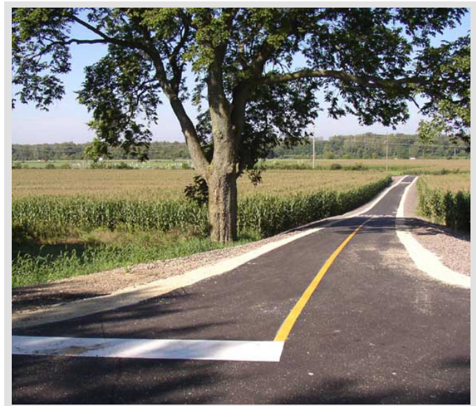
Paved portion of the Simon Kenton Trail south of Urbana