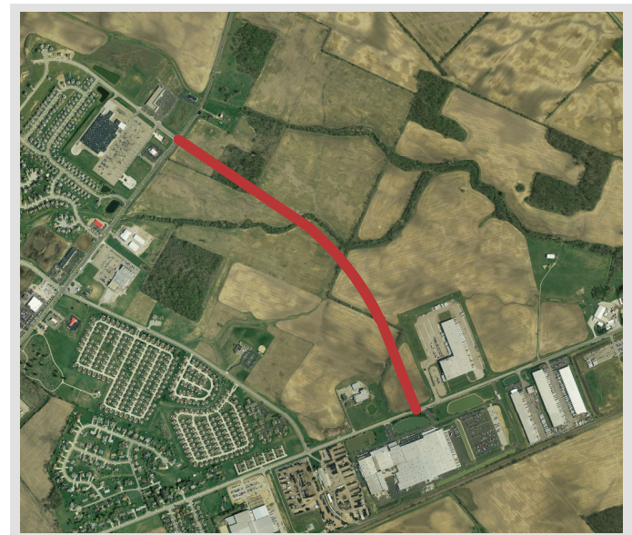
Aerial view of project location