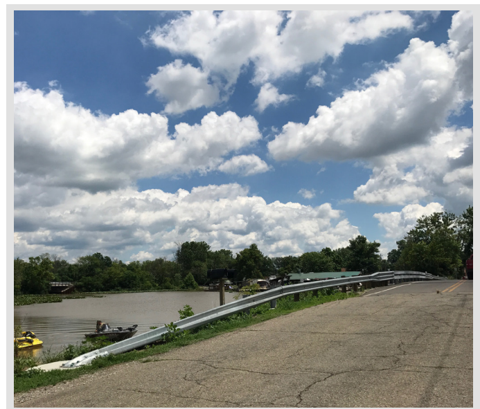
Honeycreek Road crossing the cove of Buckeye Lake near Thornport

Southeastern corner of Buckeye Lake, showing a promenade along the lakeshore and improvements to the SR 13 corridor