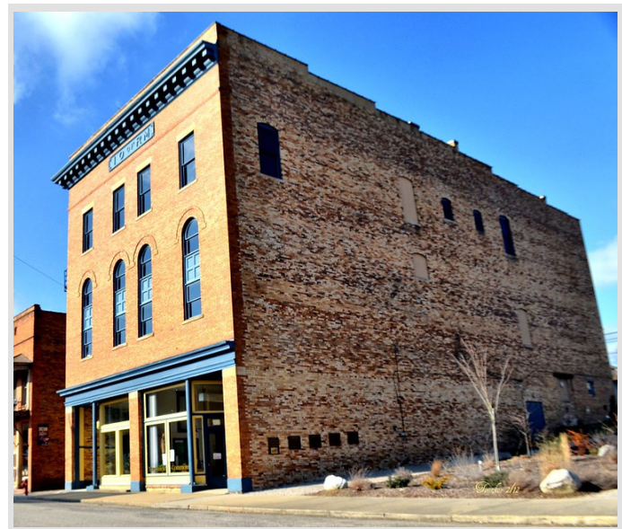
Tecumseh Theater in Shawnee