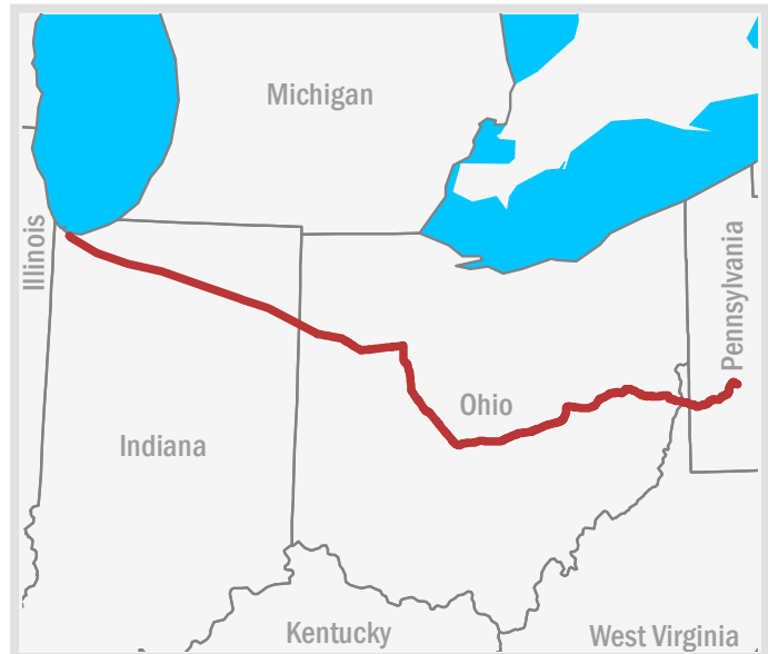
Approximate location of the proposed Midwest Connect rapid speed transportation (hyperloop) segment connecting Chicago, Ft. Wayne, Lima, Columbus, and Pittsburgh

Partner Agencies: Columbus Partnership; JobsOhio; Ohio Department of Transportation; Ohio Rail Development Commission; multiple cities and counties; and numerous public and private partners along the corridor (e.g., business groups, local governments, regional planning agencies, etc.)