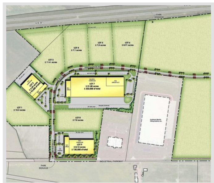
Concept for northern section of the 33 Innovation Park