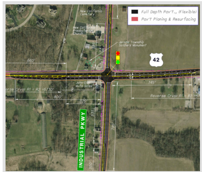
Planned intersection improvements at US 42 and Industrial Parkway