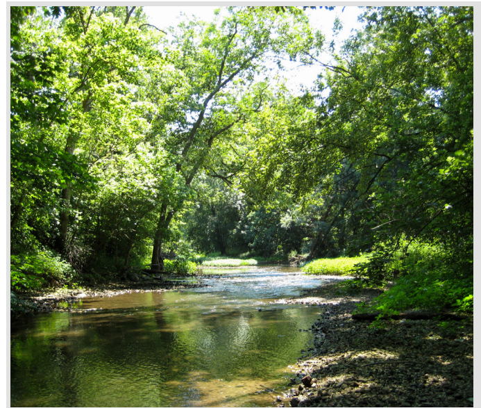
Section of the Big Darby Scenic River