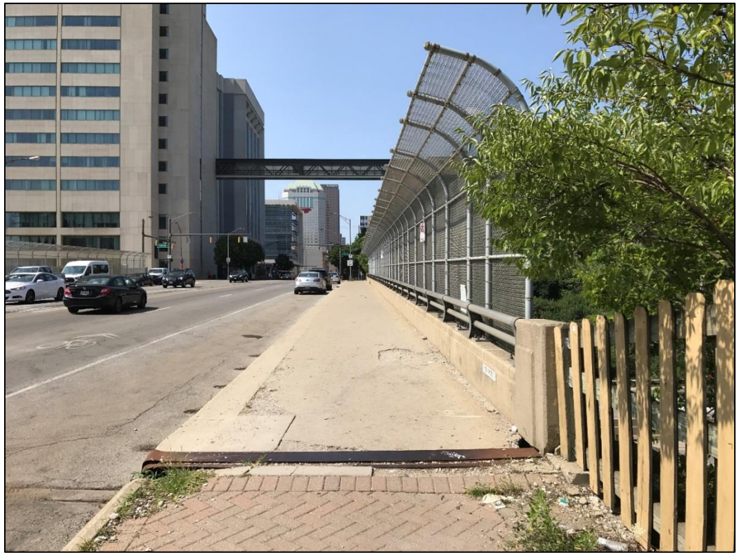
High Street on eastern sidewalk of bridge: proposed (top) and existing (bottom)