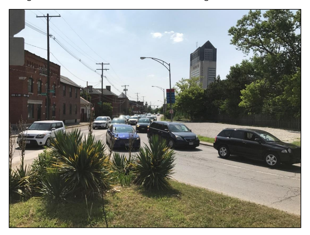
Livingston Avenue PM congestion

Livingston Avenue and Fourth Street - PM congestion due to vehicles entering freeway