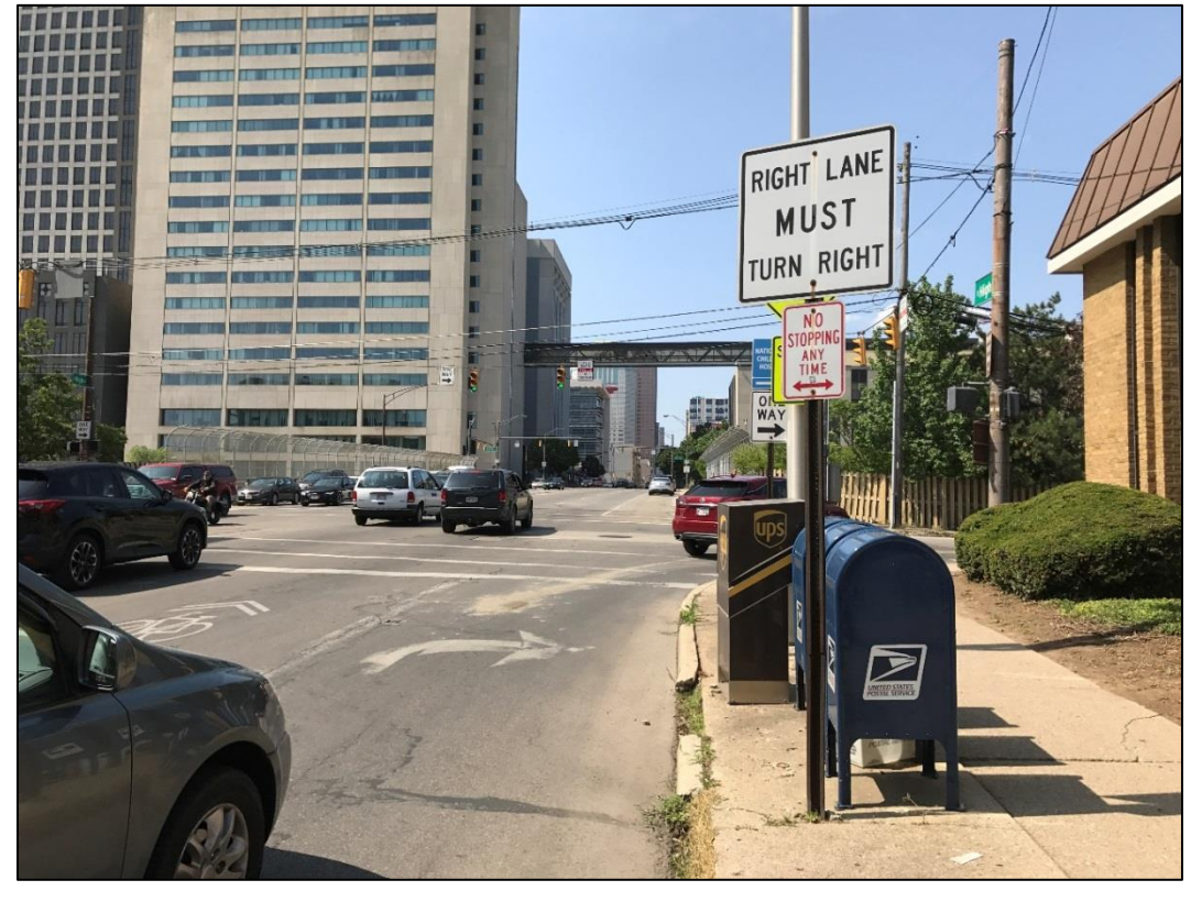
High Street looking north across Livingston Avenue: proposed (top) and existing (bottom)