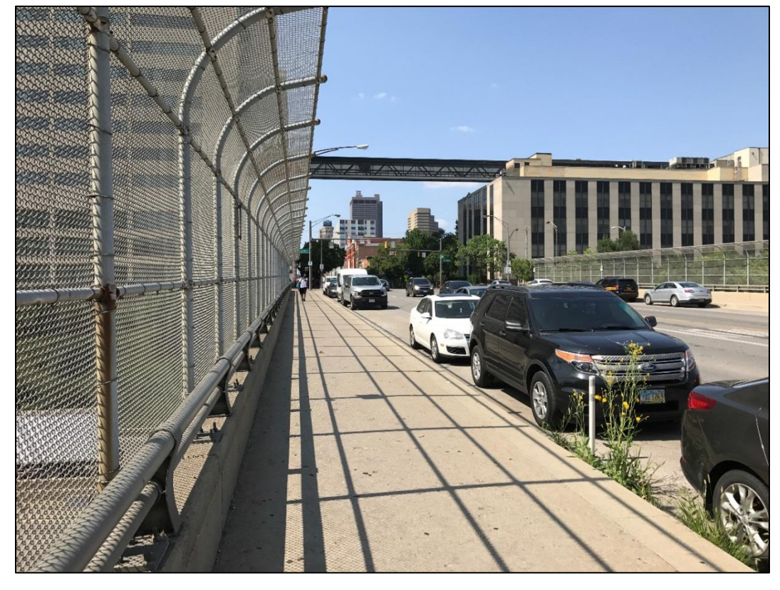
High Street on western sidewalk of bridge: proposed (top) and existing (bottom)