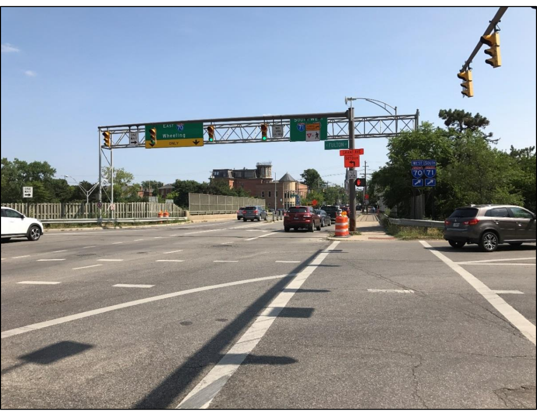
Third Street looking south across interstate trench: proposed (top) and existing (bottom)