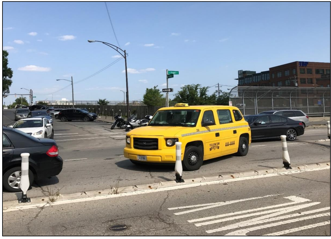
Corner of Front Street and Fulton Street looking southeast: proposed (top) and existing (bottom)