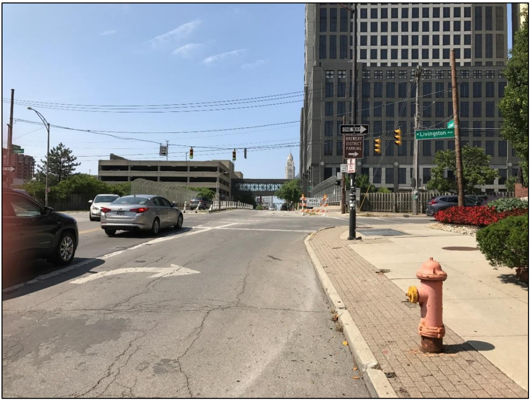
Front Street looking north across Livingston Avenue: proposed (top) and existing (bottom)