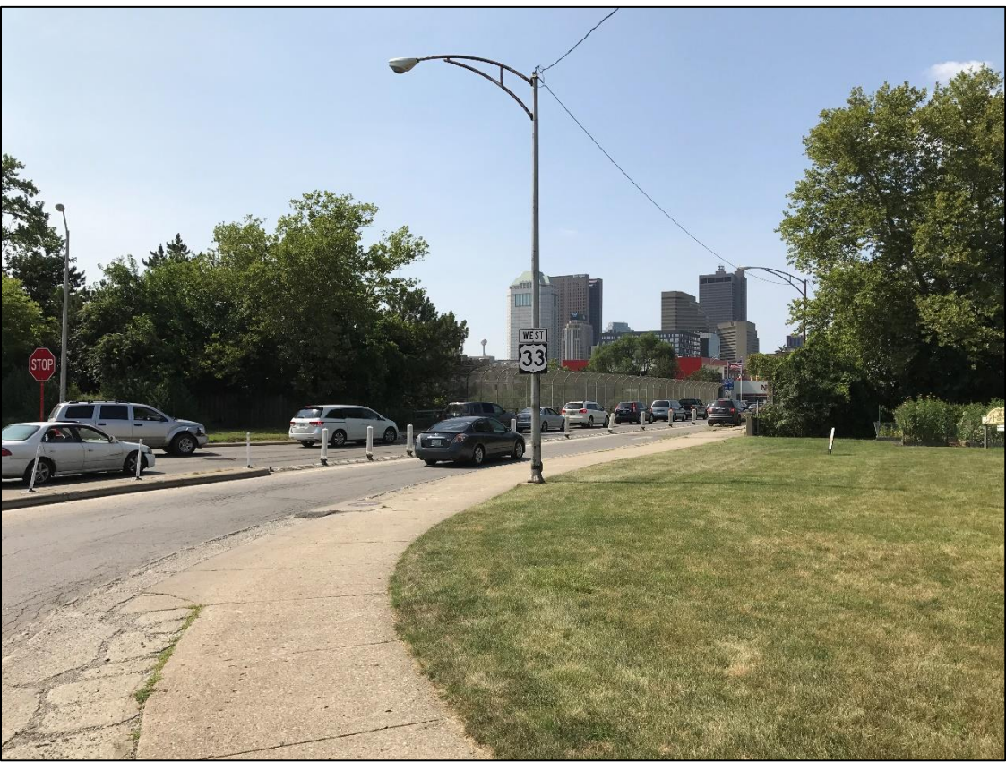
Fourth Street looking northwest: proposed (top) and existing (bottom)