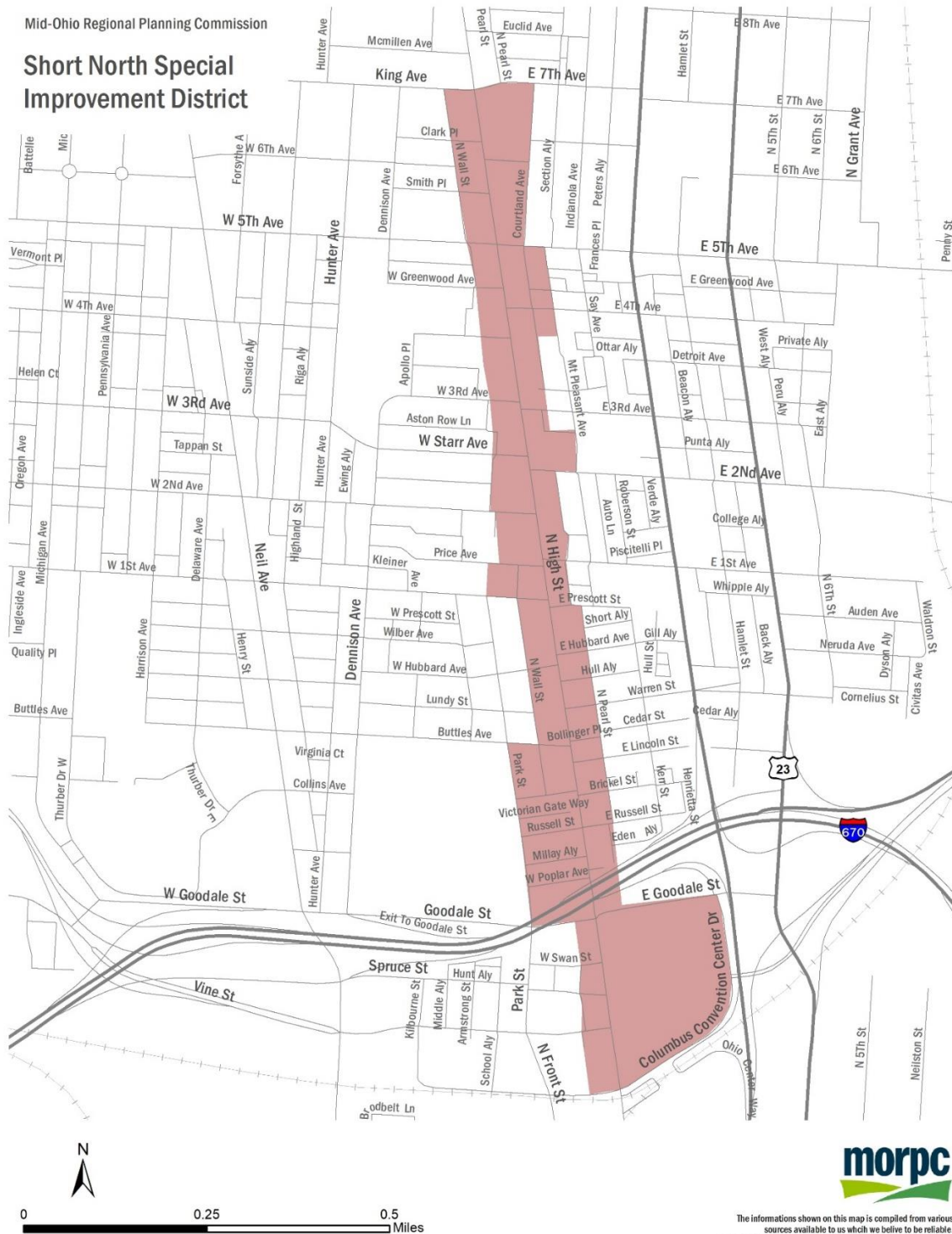
Figure 2: Short North Special Improvement District