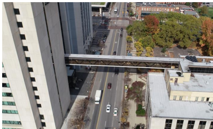
Existing Pedestrian Bridge over South High Street

The project is scheduled to begin on November 6, 2020 at 7:00pm . The demolition will require the closure of South High Street between Fulton Street and Mound Street to vehicular and pedestrian traffic and will continue through the end of the day on Sunday, November 8, 2020.