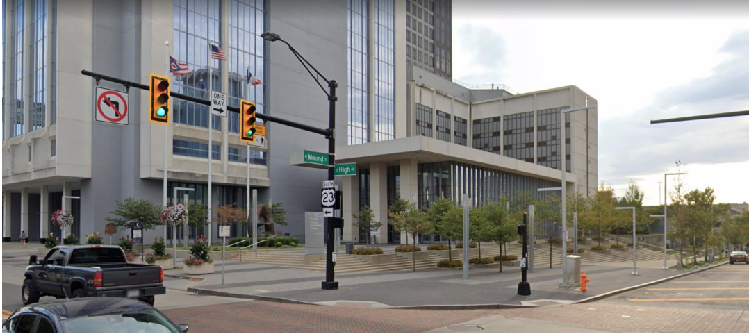
Entrance to 369 South High Street

The pedestrian entrance to 375 South High Street will be closed for the duration of the project. Pedestrians seeking access to 375 South High Street will be routed through the entrance to 369 South High Street located at the southwest corner South High Street and Mound Street.