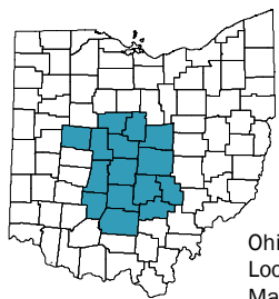
Ohio Location Map