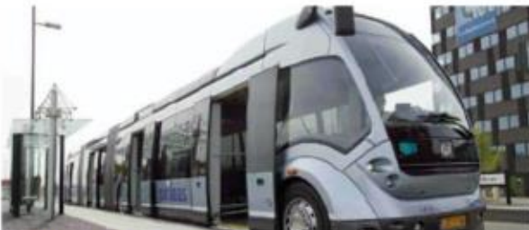
Frequency & Capacity