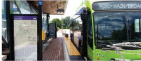
Level & Multi-Door Boarding