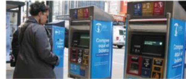
Off-Board Fare Collection