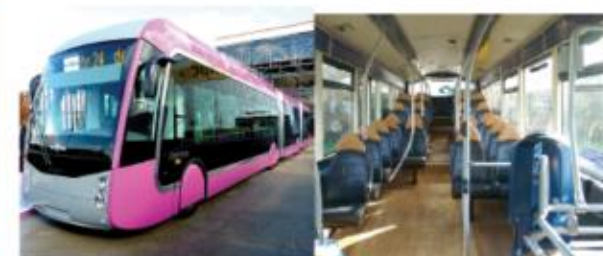
Modern Vehicle Designs