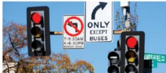
Signal Priority & Intersection Control