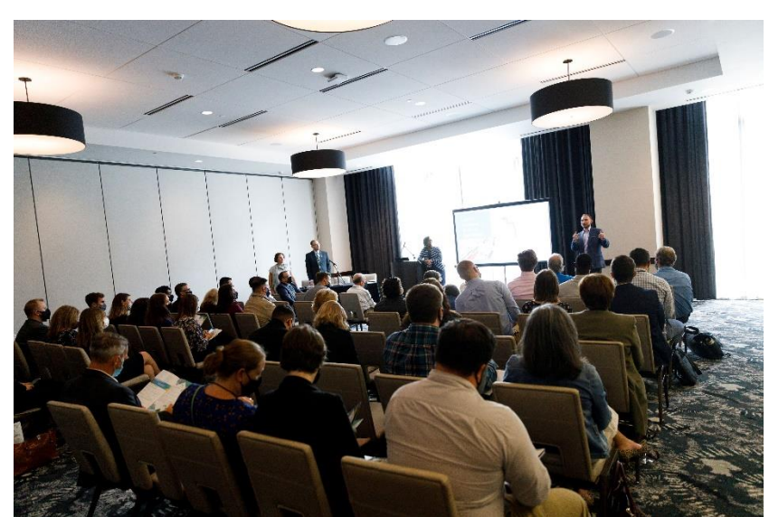
2021 SUMMIT ON SUSTAINABILITY