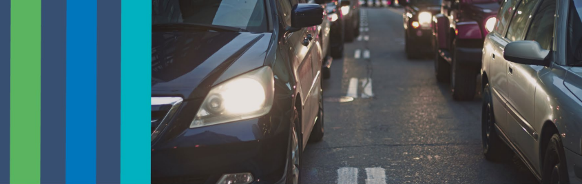
15-County Region Population