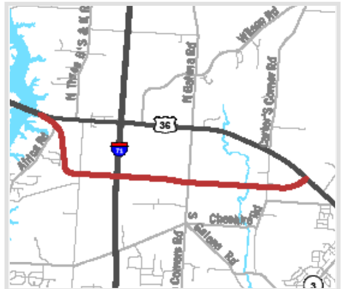
Project Location Interstate 71 and US 36/SR 37