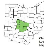
Ohio Location Map